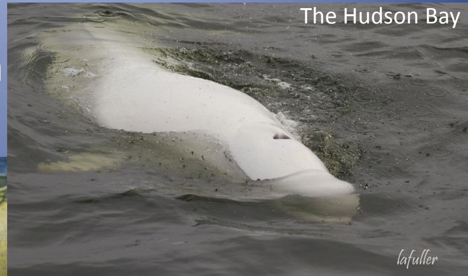
The Hudson Bay