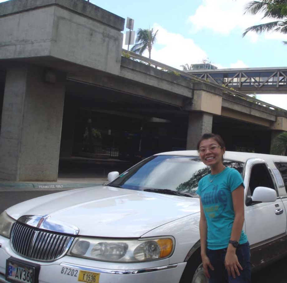
(Not our car)