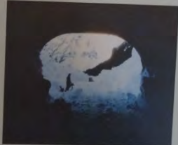
HOMER TUNNEL — Never stop outside the tunnel portals. The tunnel is open for two-way traffic at all times and there are two passing bays inside the tunnel, 100 metres from each end.

SAFE STOPPING AREAS There are two safe stopping areas: ■ The Chapel ■ Monkey Creek