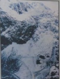
WEST SIDE — Drive at the speed appropriate for the conditions; use your gears to control speed, not your brakes!