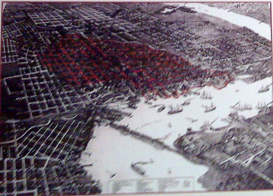
Map showing extent of May 3, 1901 fire. Burned area is shown in RED.

Gentlemen will please refrain from Smoking, Spitting OR USING Profane Language During the Performance